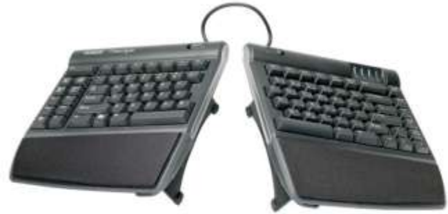
2. Kynesis Freestyle VIP