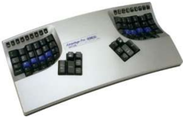
1. Kynesis Advantage/Advantage Pro