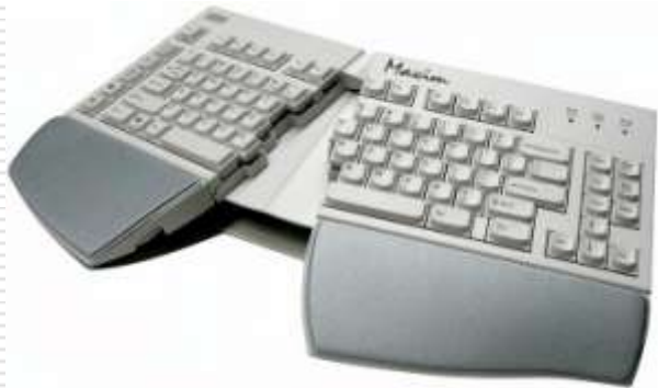
3. Kynesis Maxim